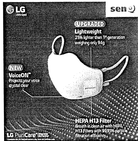
Figure 3: LG face mask